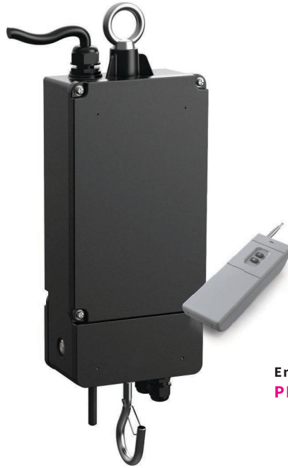
Emergency Driver for PL-SHB-120-200W PLSHBED